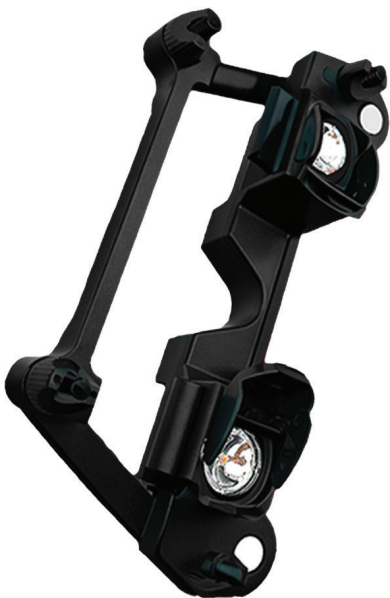
Calpito Road Courtesy Lights